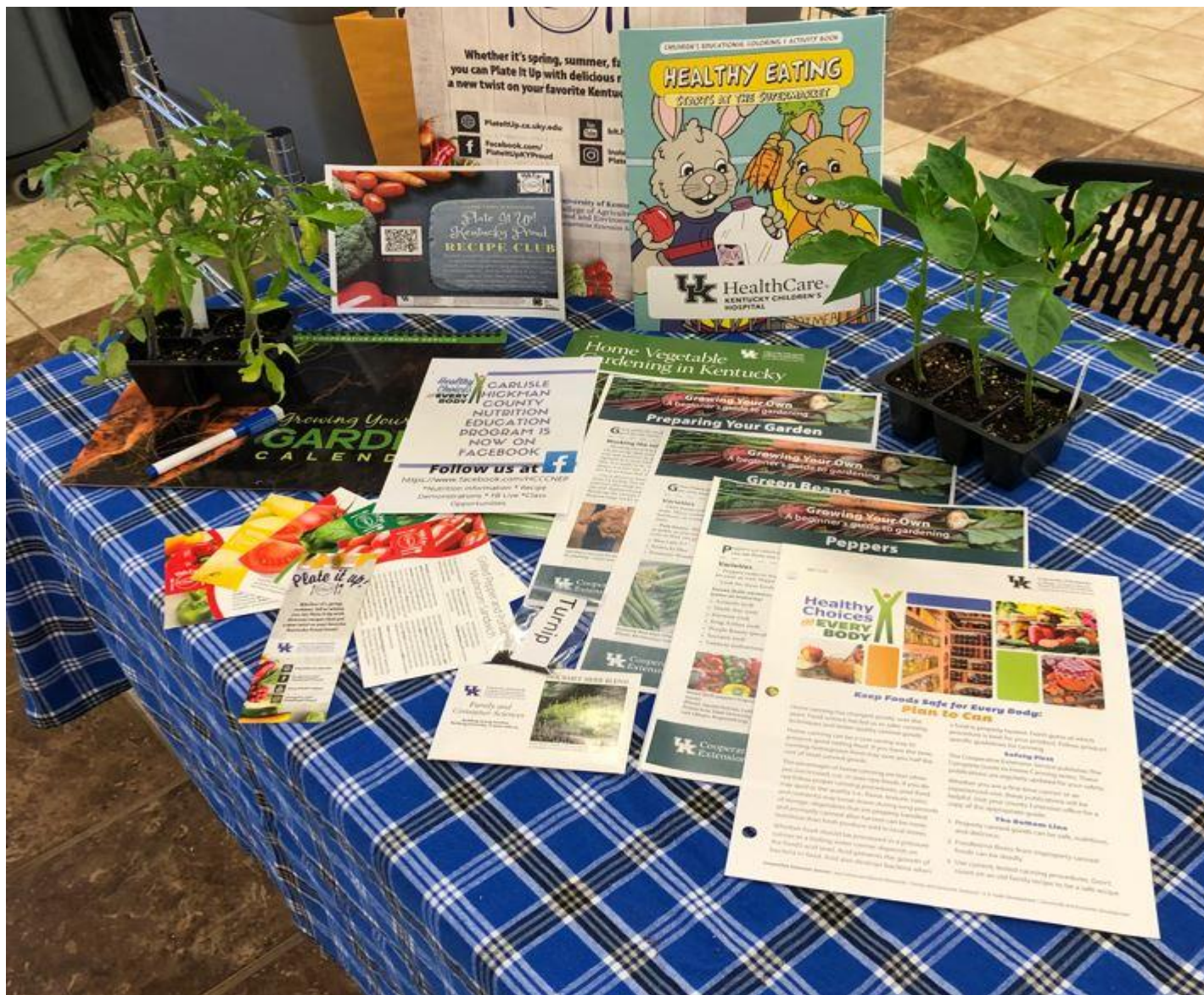
Garden Give Away-April 14 at the Carlisle County Extension Office-pictured here plants given away last year.